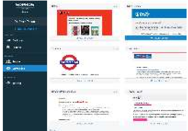
Example Phish Threat attack simulations and training

Priced per user with bands from 5 to 5000+, Sophos Email keeps things simple so you can focus on protecting your business, data, and employees.